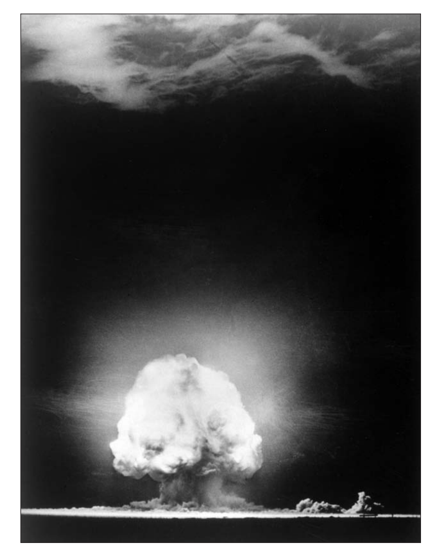
FIG. 2 Photographic documentation of the Trinty test, the detonation of the "Gadget" by the U.S. Army in New Mexico on 16 July 1945.

so bad you couldn't read the equations. And so I had to go down to the National Library of Medicine and actually get an original copy of the report—it was the only place in the country that even had one—and make my own photocopies of it and really work with it, which is really ... that's what a historian does, right?